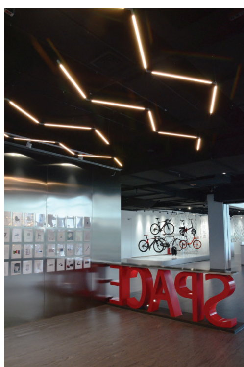
Z-Bar Pendant Zig Zag Dimensions