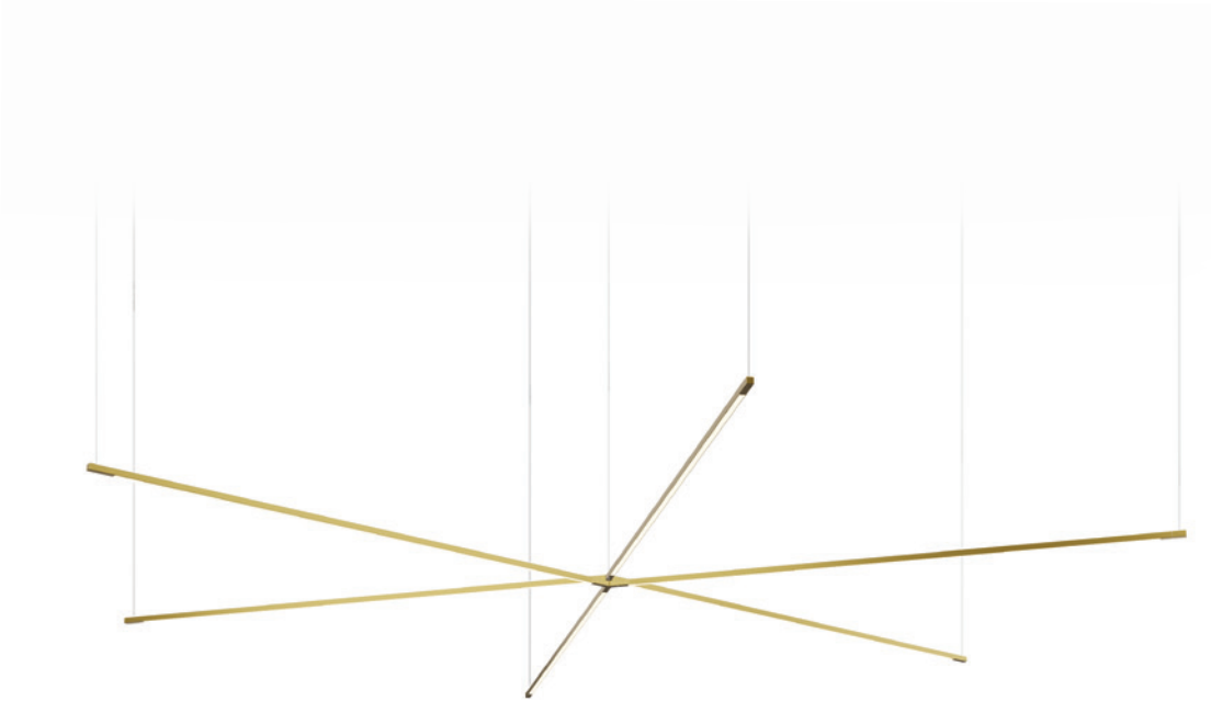
tri-star with 48" light bars