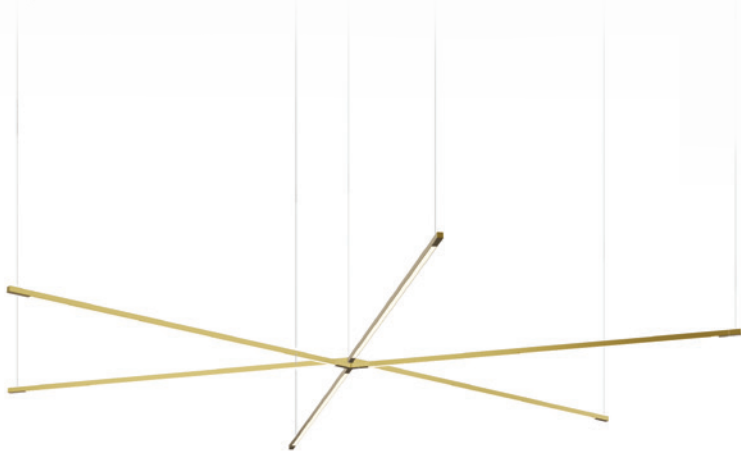
tri-star with 36" light bars