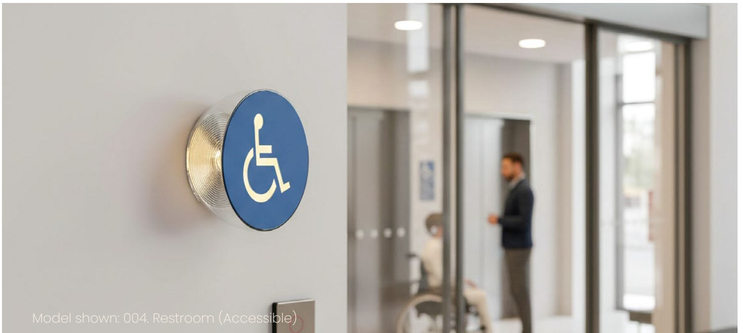
Model shown: 004. Restroom (Accessible)