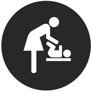
028. Baby Changing