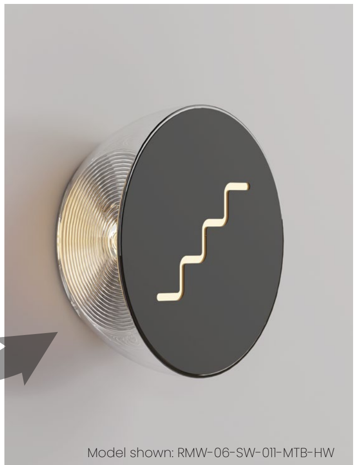
Model shown: RMW-06-SW-011-MTB-HW