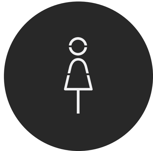
002. Restroom (Female)