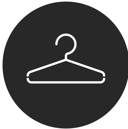
020. Changing room