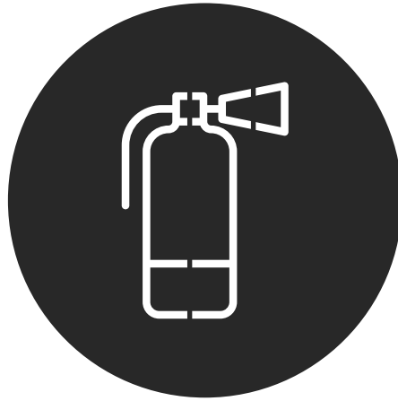
023. Fire Extinguisher