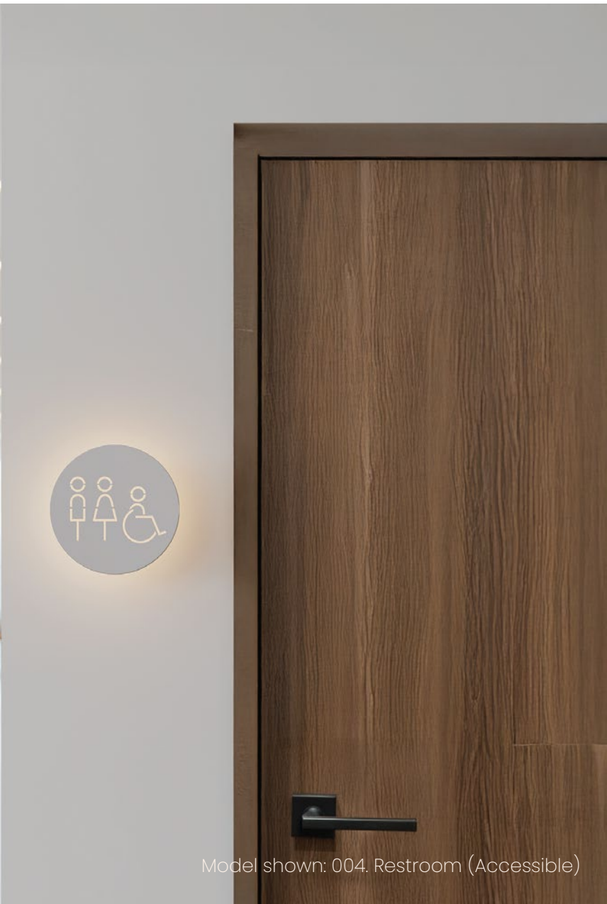
Model shown: 004. Restroom (Accessible)