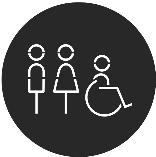
004. Restroom (Accessible)