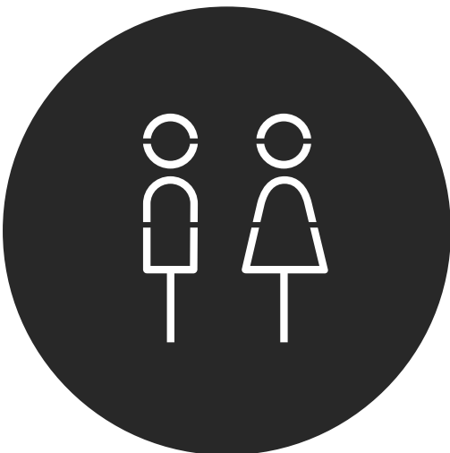
003. Restroom (All Gender)