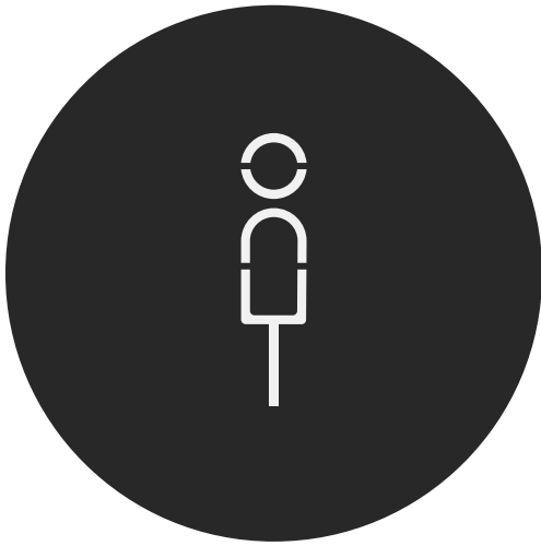
001. Restroom (Male)