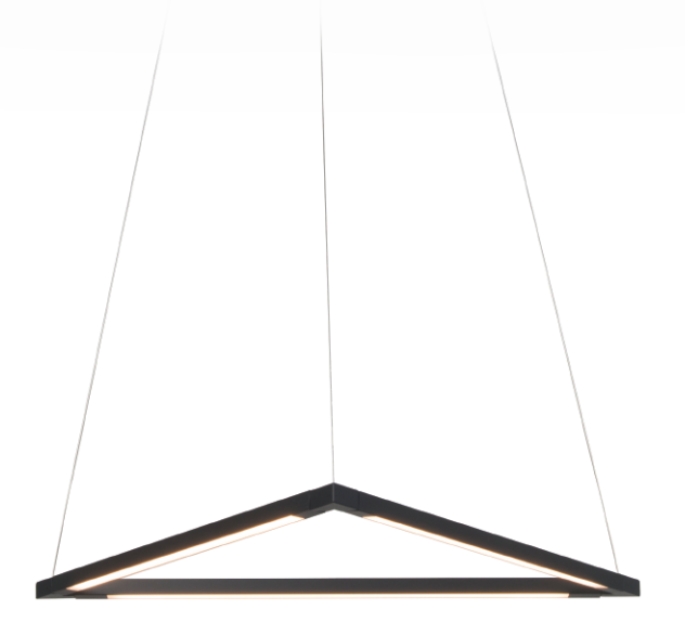
triangle with 16" light bars