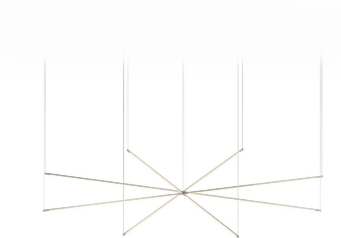
quad-star with 48" light bars