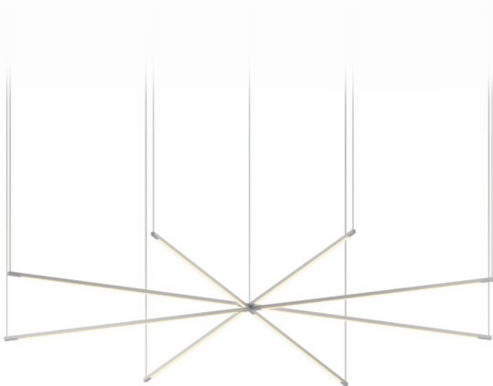
quad-star with 36" light bars