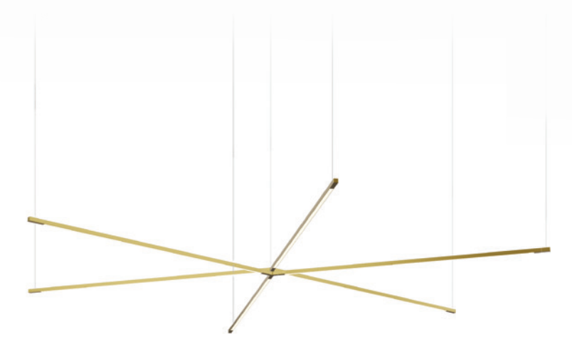
tri-star with 36" light bars