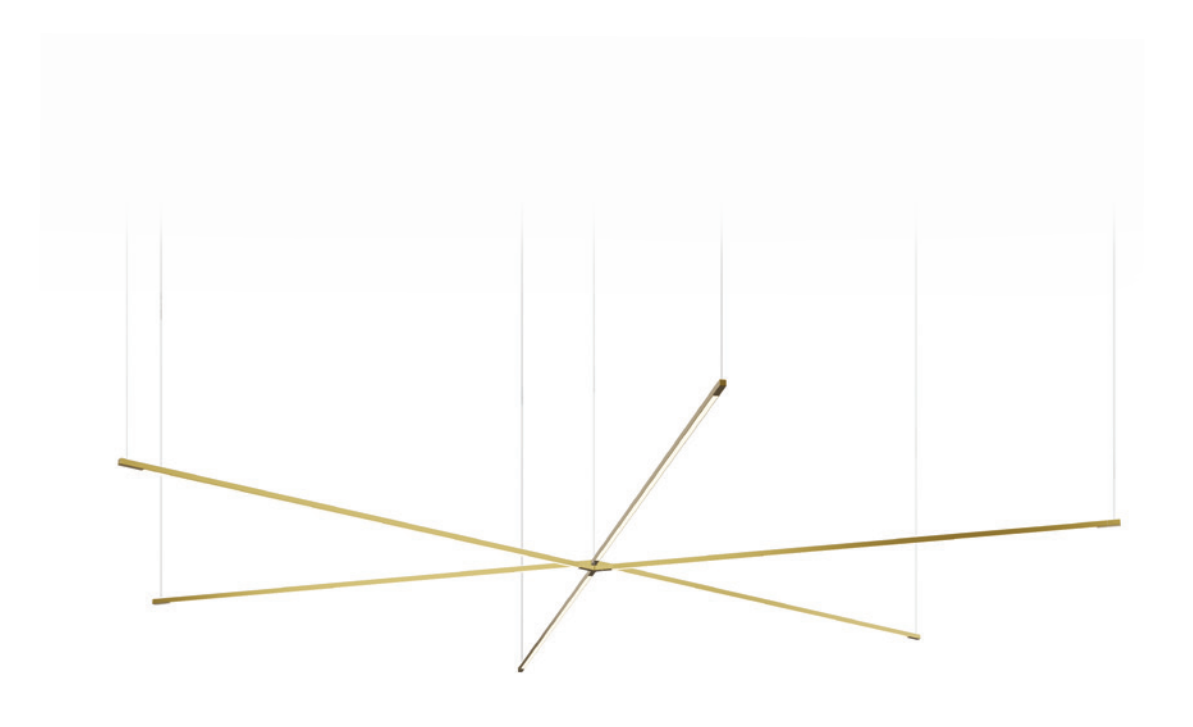
tri-star with 48" light bars