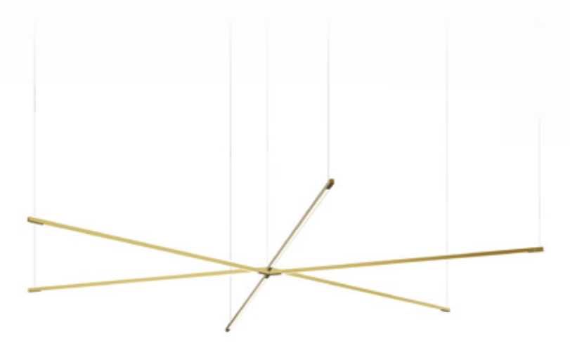
tri-star with 36" light bars